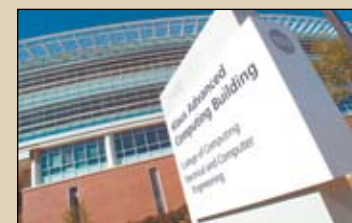
The U.S. Green Building Council awarded a Leadership in Energy and Environmental Design (LEED) Gold certification to the Christopher W. Klaus Advanced Computing Building.

The Arbor Day Foundation designated Tech a Tree Campus USA in November.