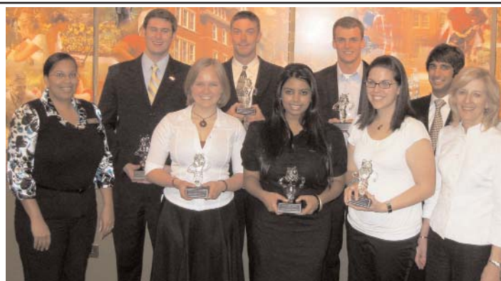
2009 IMPACT SCHOLARSHIPS

What is the impact package? The application is completely online. There are two essays, "what impact have you made on the Georgia Tech community" and "what changes, if any,