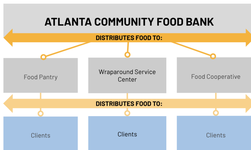
Figure 1: Current Atlanta Community Food Bank Model ( Family Independence Initiative not included in current model )

reducing the need and stabilizing lives - I broke down the current distribution structure into the categories seen in Figure 1. The categories in the middle row represent the three major partner agency types that currently service working families in The Food Bank network: Food Pantries,