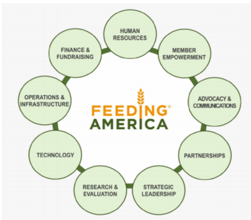
Figure 3: Feeding America Capacity Framework

Second in the application of the tool are the non-negotiables. One of the ways The Food Bank is trying to change the economic positioning of its clients is through the reduction of trade-offs. By reducing the times clients decide to buy food instead of paying for other services, a client can repurpose those funds for things such as transportation or medical visits. The Emergency Food Assistance Program allows Food Bank partner organizations to provide a greater quantity of food to clients. Organizations that distribute food to clients for home consumption are eligible, but must register with the United States Department of Agriculture for the service (USDA TEFAP