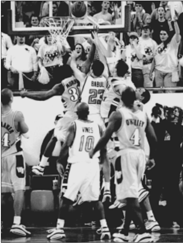
ESPN's Big Monday College Basketball Game has been compared to the NFL's Monday Night Football. Is the business of College Hoops making too much of an impact on the team, the student and the fan? Who's really in charge?

For the past 20 years, some believe collegiate sports has in many ways become more tailored for the television