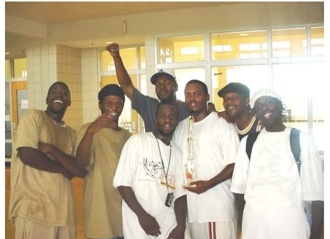
2nd place Basketball team;