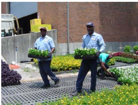
Landscape employees preparing for spring planting.