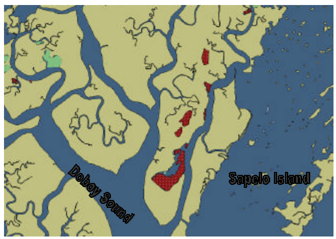
Figure 1. Back-barrier islands sampled in McIntosh County, GA are indicated by shading.

We conducted a series of field observations within and near the Georgia Coastal Ecosystems Long Term Ecological Research (GCE LTER) site at Sapelo Island, Georgia, during the summer and fall of 2002 (Fig 1). The back-barrier islands were selected on the basis of accessibility, minimal impact from residential or agricultural development, natural origin (as opposed to dredge spoil) and size. Back-barrier islands were identified using an ESRI ArcView v.3.2 map database provided by the Georgia Dept. of Natural Resources