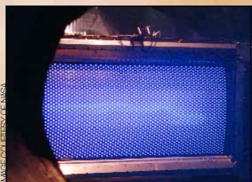
NASA's Project Prometheus reached an important milestone in November 2003 with the first successful test of a High Power Electric Propulsion (HiPEP) ion engine that could lead to revolutionary propulsion capabilities for space exploration missions throughout the solar system and beyond.

@ Read more at: gtresearchnews.gatech.edu/newsrelease/neptune.htm