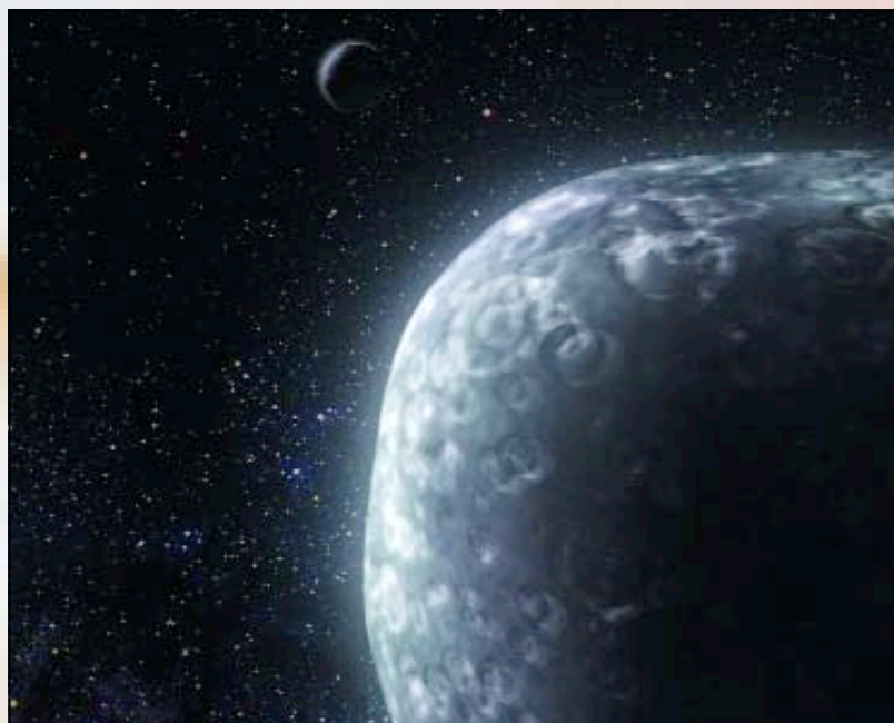
This is an artist's view of a Kuiper Belt binary object, icy bodies usually found at the fringe of our solar system. Scientists believe these objects are key to the solar system's development. A NASA-funded vision mission team is interested in exploring Neptune's moon Triton, which may be a Kuiper belt object.

The plan is based on the availability of nuclear-electric propulsion technology under development in NASA’s Project Prometheus. A traditional chemical rocket would launch the spacecraft out of Earth orbit. Then an electric propulsion system powered by a small nuclear fission reactor — a modified submarine-type technology — would propel the spacecraft to its deep-space target. The propulsion system would generate thrust by expelling electrically charged particles called ions from its engines. The technology is expected