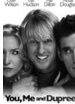
You, Me and Dupree