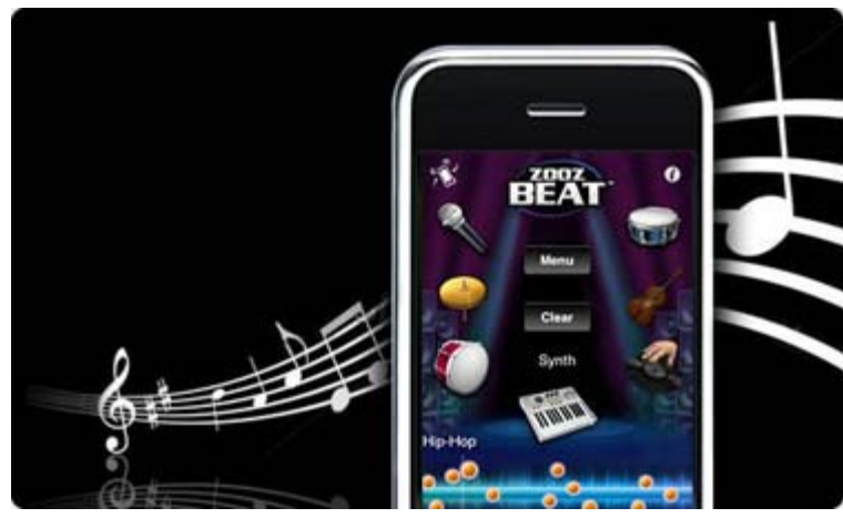
ZOOZ Mobile , one of two companies spun from the new Center for Music Technology, has been awarded the prestigious Small Business Innovation Research grant from the National Science Foundation.