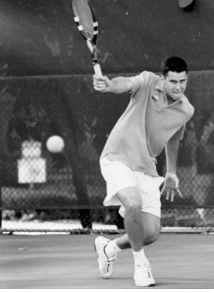
By Bill Allen / STUDENT PUBLICATIONS

The women's team will return to action today when it plays in the