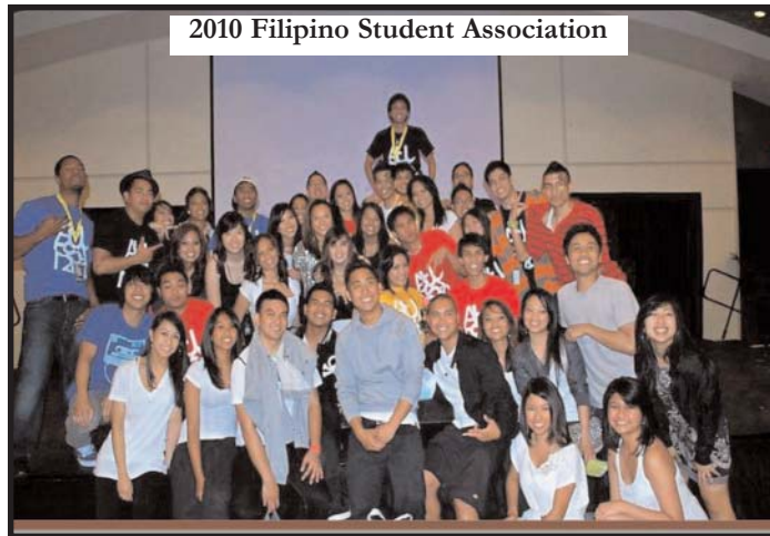
2010 Filipino Student Association

Auxiliary Services provided $600 to the Filipino Student Association for promotional items at its Culture Shock 2010 event, Saturday, April 24.