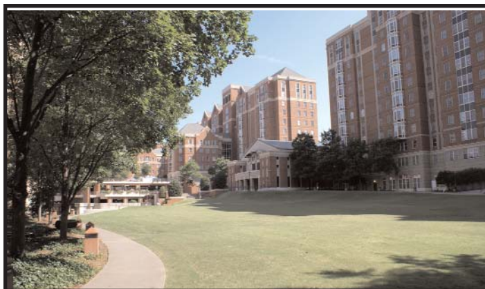
Housing is renovating residence halls like the North Avenue Apartments (above) and Fitten, Freeman and Montag to meet LEED certification standards as well as educating its occupants, both students and employees, to operate the buildings to LEED certifications.

Eight more have been registered, with 16 more built to code (but not yet certified).