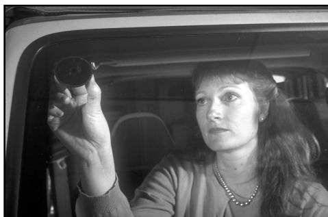
The MACBOX data recorder system.

gtresearchnews.gatech.edu/reshor/rh-win02/speed.html