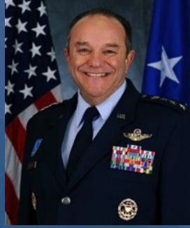
Spring commencement speakers