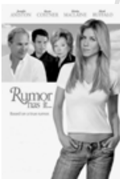
Rumor Has It

Don't miss these exciting GTCN movies every night at 7:00 and 11:00pm!