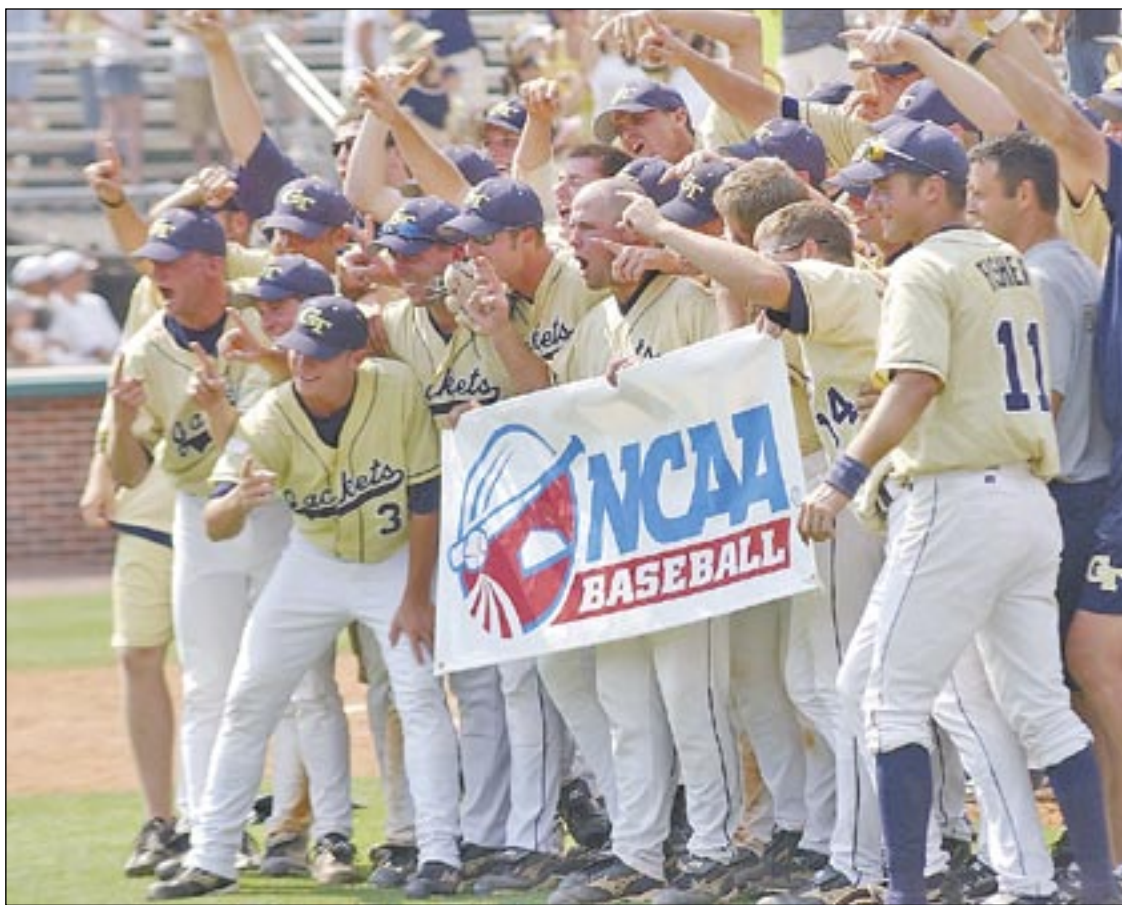
By Ayan Kishore / STUDENT PUBLICATIONS

The Cougars managed to gain a run in the bottom of the eighth, but the Jackets responded with four runs in the top of the ninth to cushion