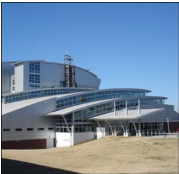
The facility was built around the Aquatic Center used in the 1996 Olympics.

Students with a Georgia Tech parking permit can use their buzzcards to park at the facility on the weekend and during the week from 5:30 to 8 a.m. and from 4:30 p.m. to midnight.