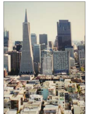
The view from Coit Tower. This year's conference will be held in the "City by the Bay."

Current CRP students can sign up in the planning studio to coordinate flights to San Francisco and sharing a hotel in the Bay City.