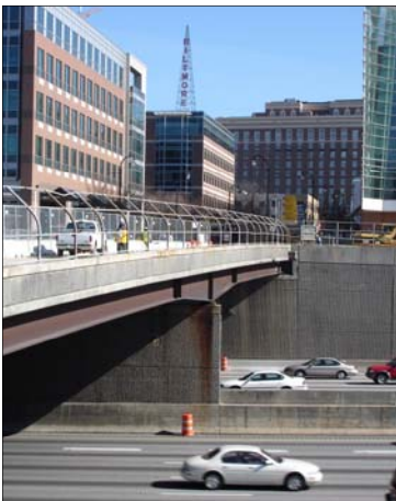
Crews closed the south side of the bridge to pedestrians, but the north side will remain open until work on the south is completed.