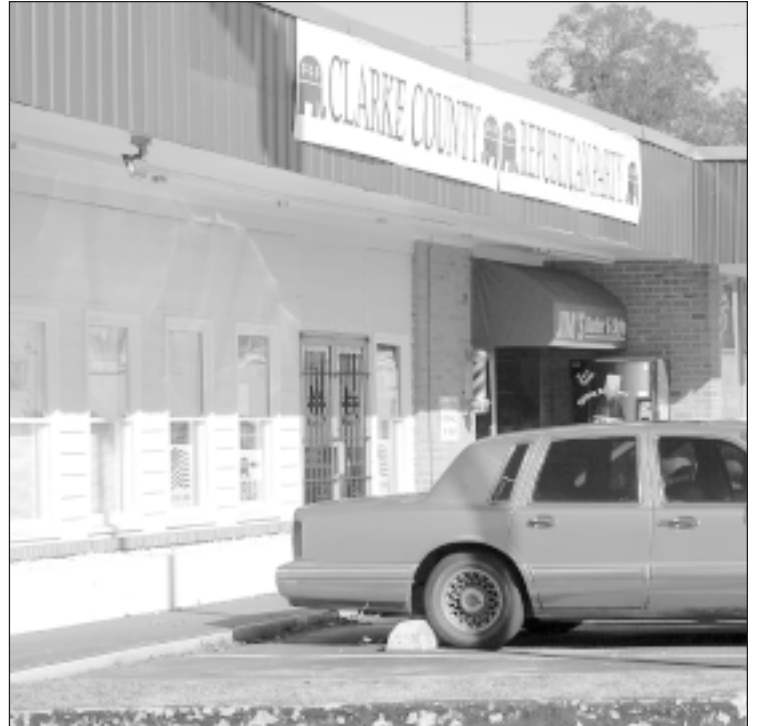
By Iwanna Beer / STUDENT PUBLICATIONS

In spite of all its efforts, the administration's educational drive seems to have been unsuccessful. Aside from the physical damage and injuries, political pundits are crediting the massive voter confusion