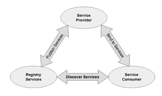
Figure 1. The Service Oriented Architecture (SOA) triangle that illustrates the fundamental design of a web services system.

SOA is a system in which services are deployed and registered by providers and able to be discovered and used by consumers. These elements exist as the SOA triangle [3], illustrated in Fig 1.