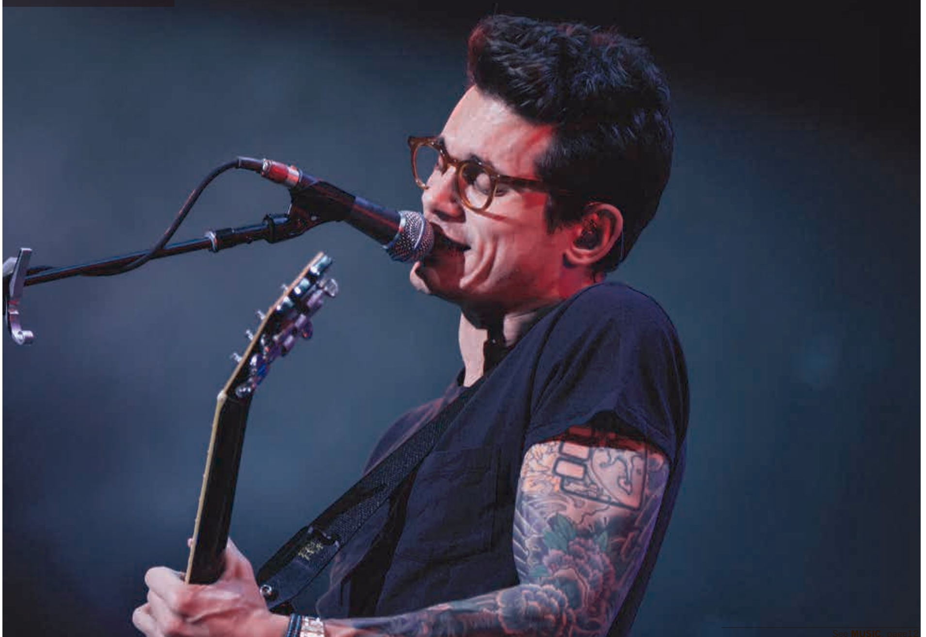
Top L: Photo by Monica Jamison Student Publications; Top R: Photo courtesy of John Nakano; Above: Photo courtesy of Elliott Brokelbank