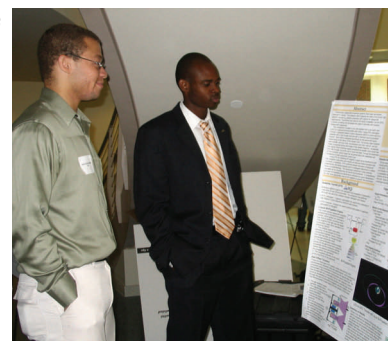
Students discuss their research at the Spring 2006 UROP poster symposium