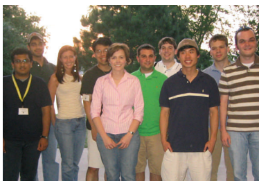
Georgia Tech students at the ACC Undergraduate Research Conference’s Dinner Luau