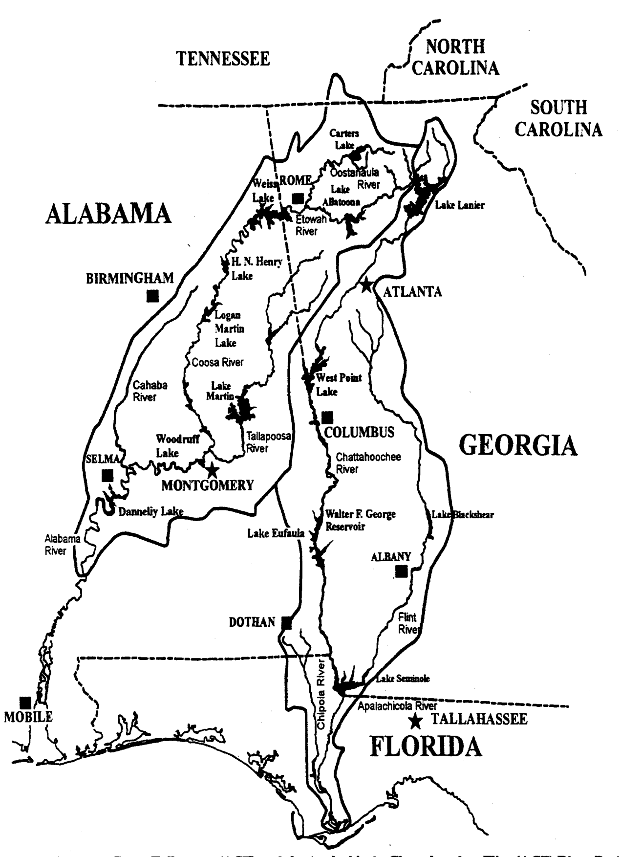
Figure 1. The Alabama-Coosa-Tallapoosa (ACT) and the Apalachicola-Chattahoochee-Flint (ACF) River Basins