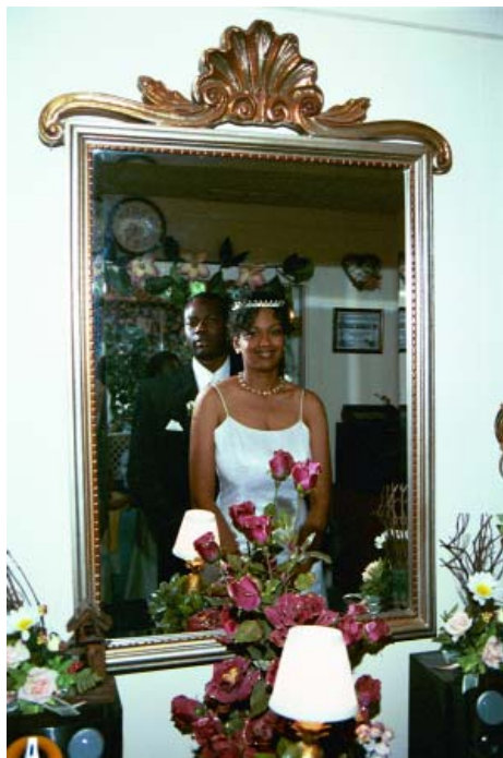
The happy couple was married on July 4 th in Helen, Georgia.