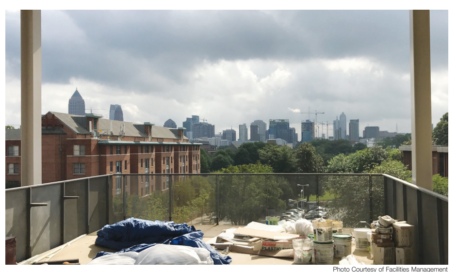
The Midtown Atlanta skyline, seeing its own flurry of construction, is visible from an outdoor terrace in the new West Village.

The addition of dedicated bicycle lanes should be complete this month, followed by lighting and striping