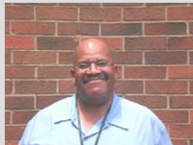
PBB (Pete Baked Beans)