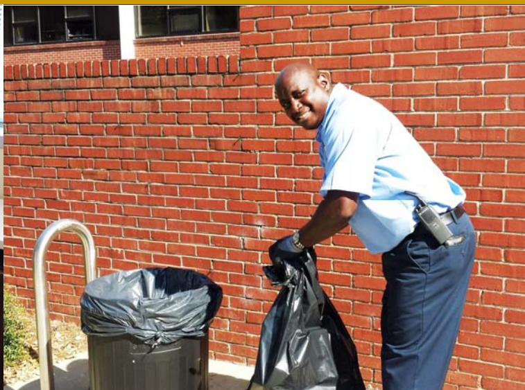
Kirby - Landscape