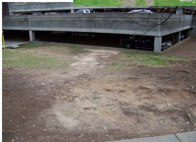
Peter's Parking Deck