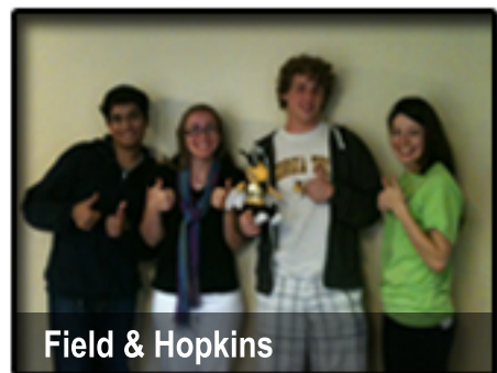
Field & Hopkins