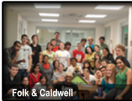
Folk & Caldwell

Below are Hall Councils who have gone past the expectations. These Hall Councils were chosen in the past month.