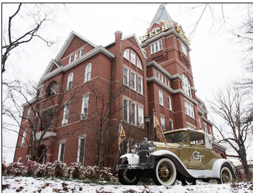
Snow day: The Ramblin' Wreck in front of Tech Tower in late January.