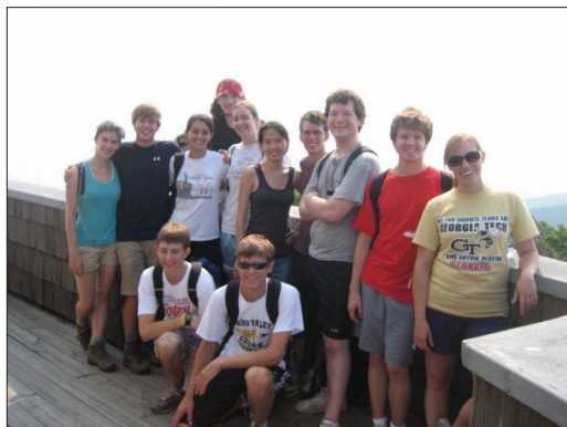
New PSs climb to the top of Brasstown Bald.