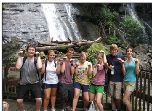
New PSs pose in front of a waterfall during their hike.