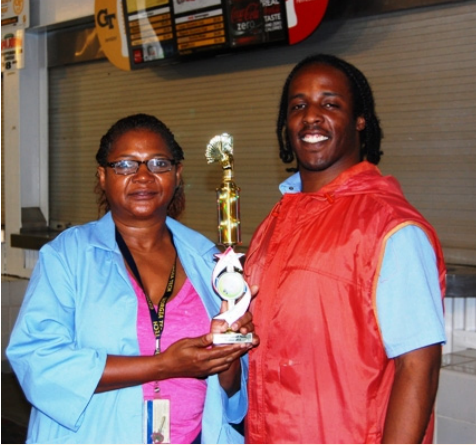
1st Place— Cards Game