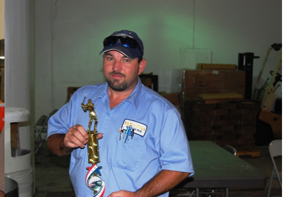
1st Place 3 Point Shoot-out