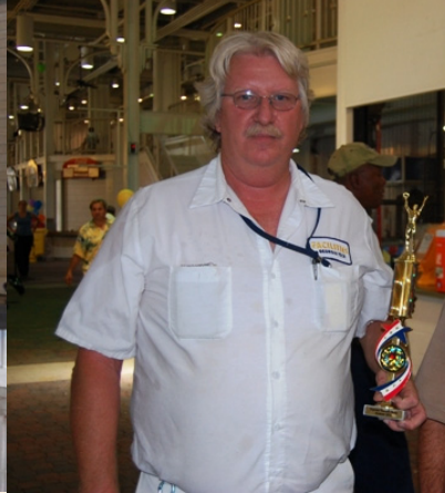
1st Place— Bean Bag